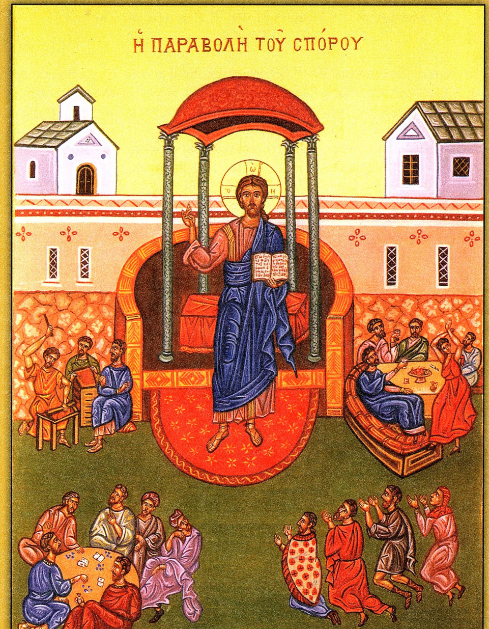
Icon of the Parable of the Sower (Luke 8:5-15)