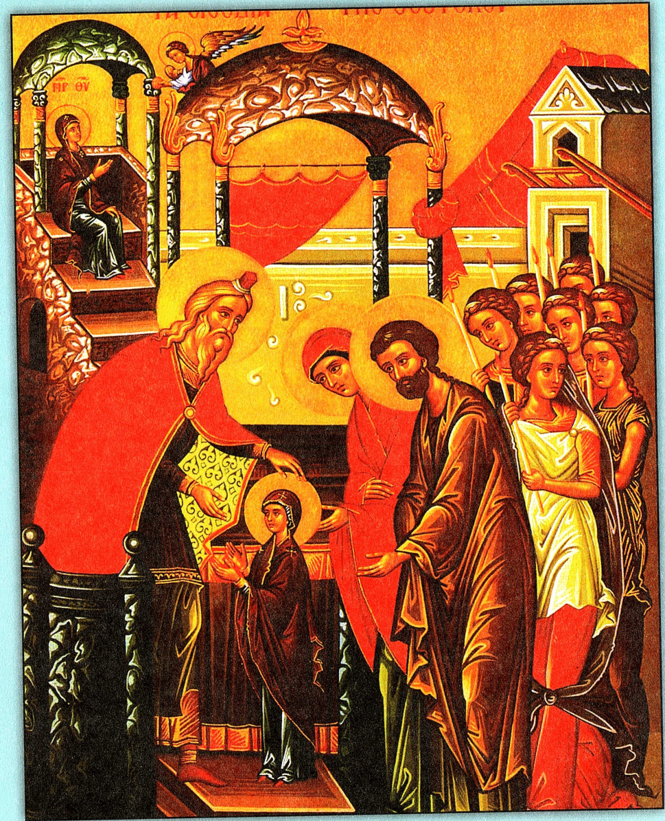
Icon of the Entrance of the Theotokos into the Temple -- November 21st