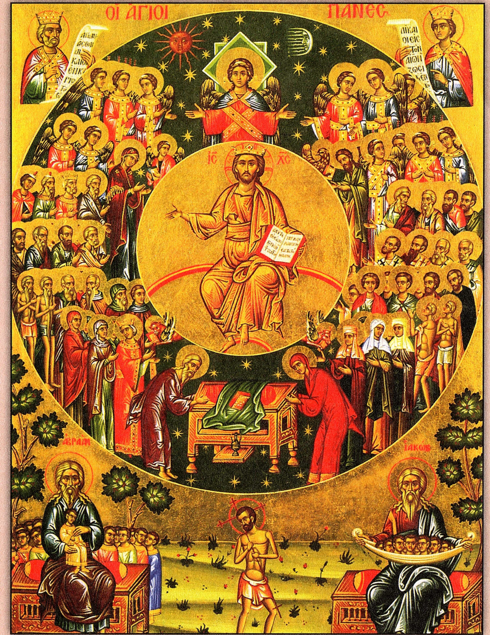
Icon of All Saints