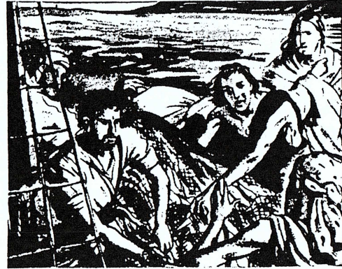
3. "We have fished all night and caught nothing," said Peter, "but we will obey." When they did so, there were so many fish that their nets broke.