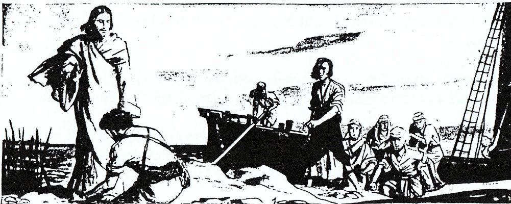
4. And Peter and all with him—for he had called James and John to help bring in the fish—were astonished. Jesus said: "Fear not! Follow Me and I will make you fishers of men." And when they had brought their boats to land they left everything and followed Him.