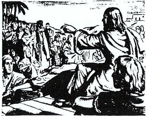
2. Jesus taught the crowds on the shore from Peter's boat. Afterwards He told Peter to launch out into the deep and let down his nets.