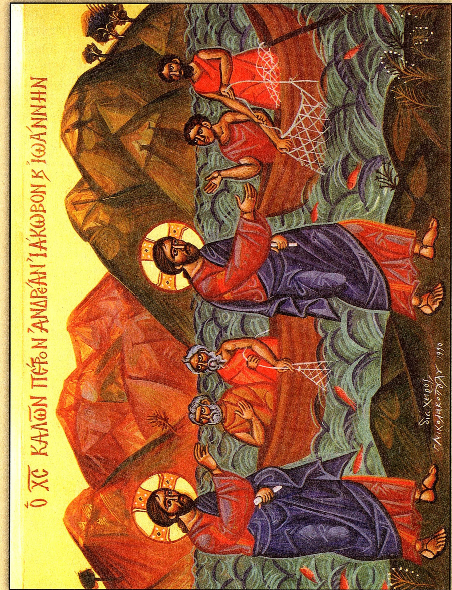
Icon of the Call of the Apostles