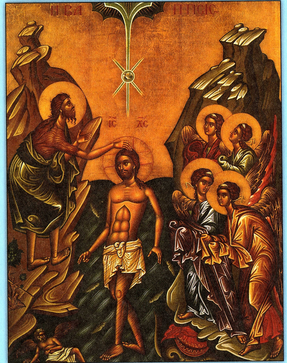
Icon of the Theophany of Our Lord -- January 6th