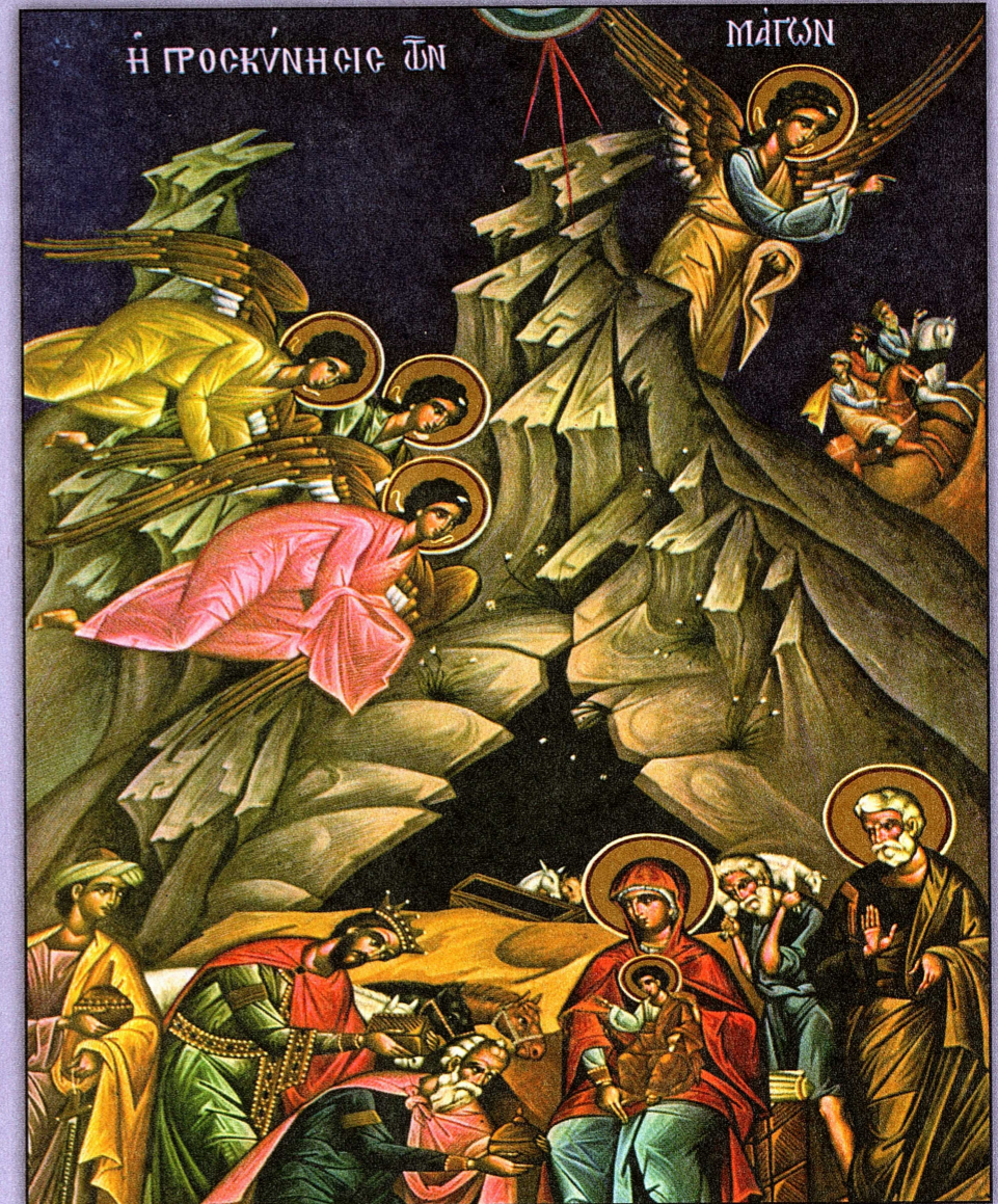
Icon of the Visit of the Magi