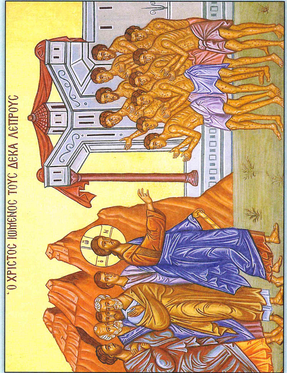
Icon of the Healing the Ten Lepers (Luke 17:12-19)