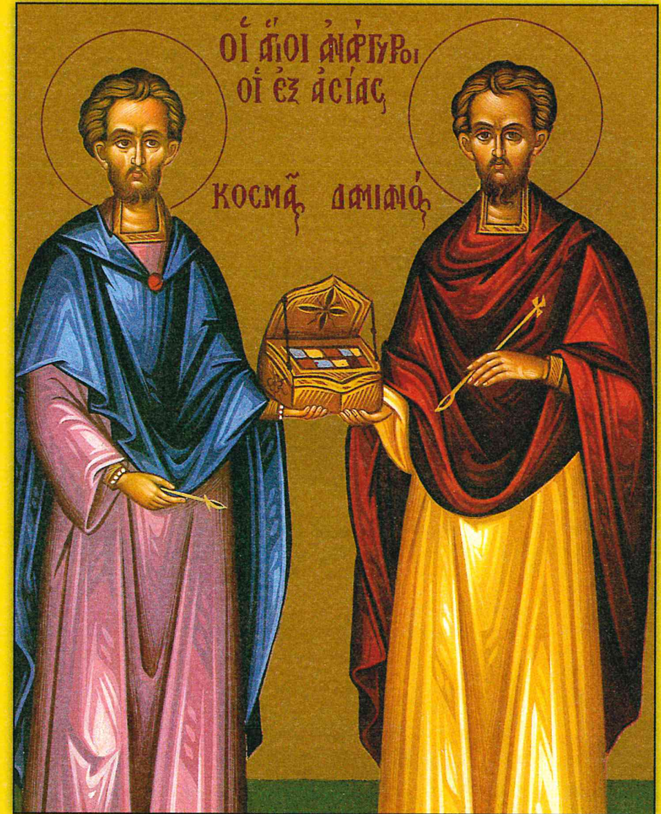
Icon of Saints Cosmas and Damian -- November 1st