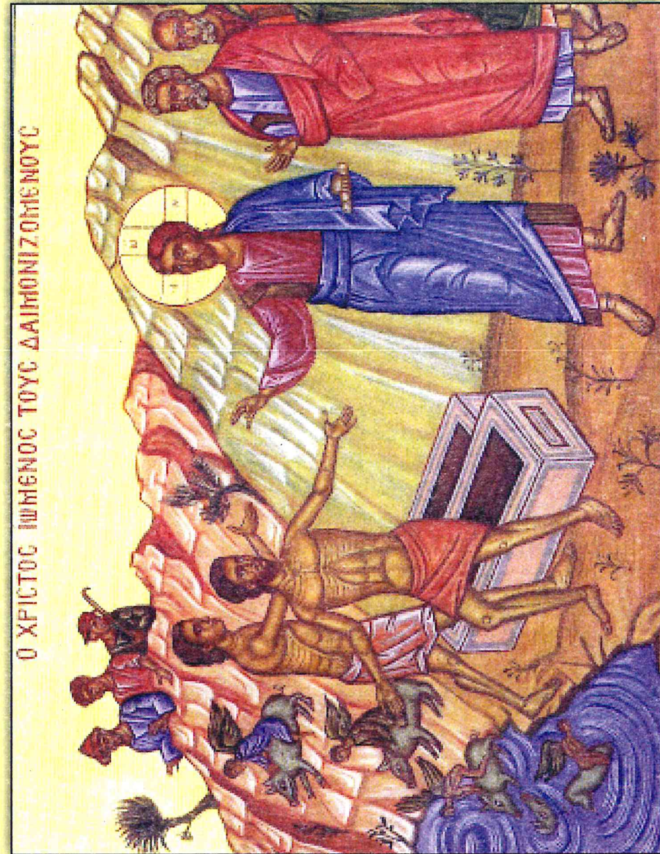
Icon of Healing the Gadarene Demoniac (Luke 8:26-39)