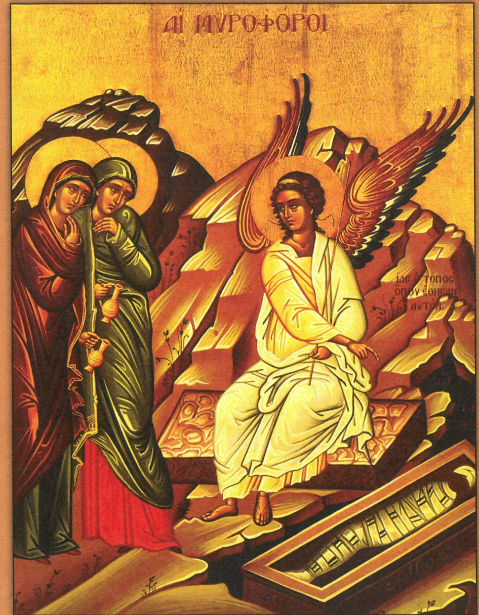
Icon of the Myrrh-bearing Women