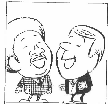
Closing the Distance

People with clenched fists can't shake hands.