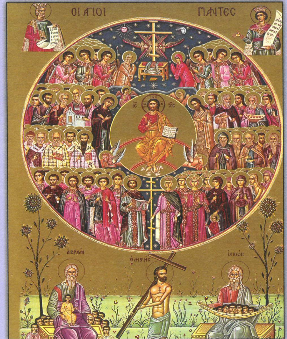
Icon of All Saints