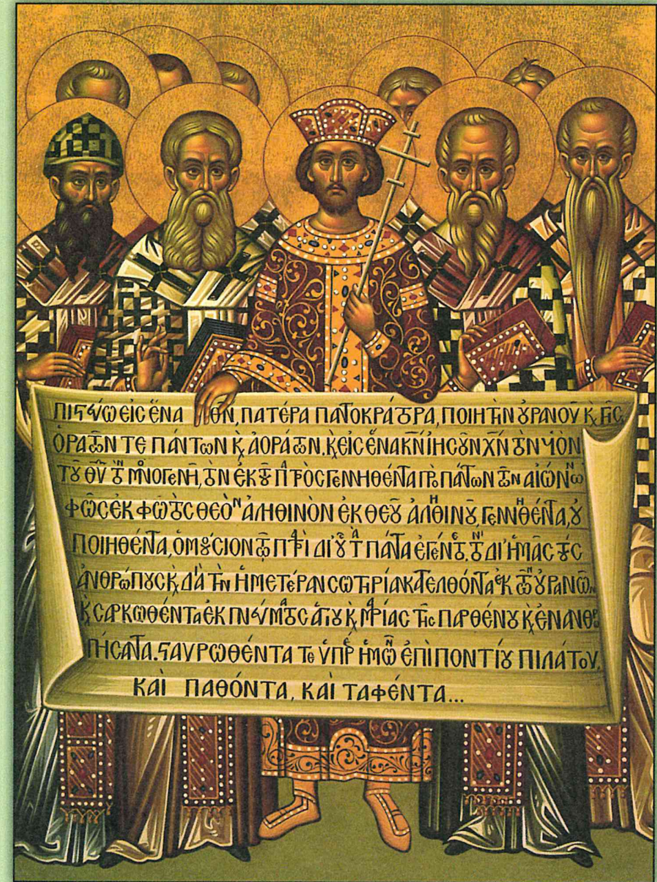
Icon of the Fathers of the First Ecumenical Council of Nicaea