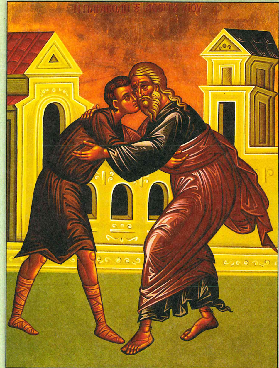
Icon of the Prodigal Son