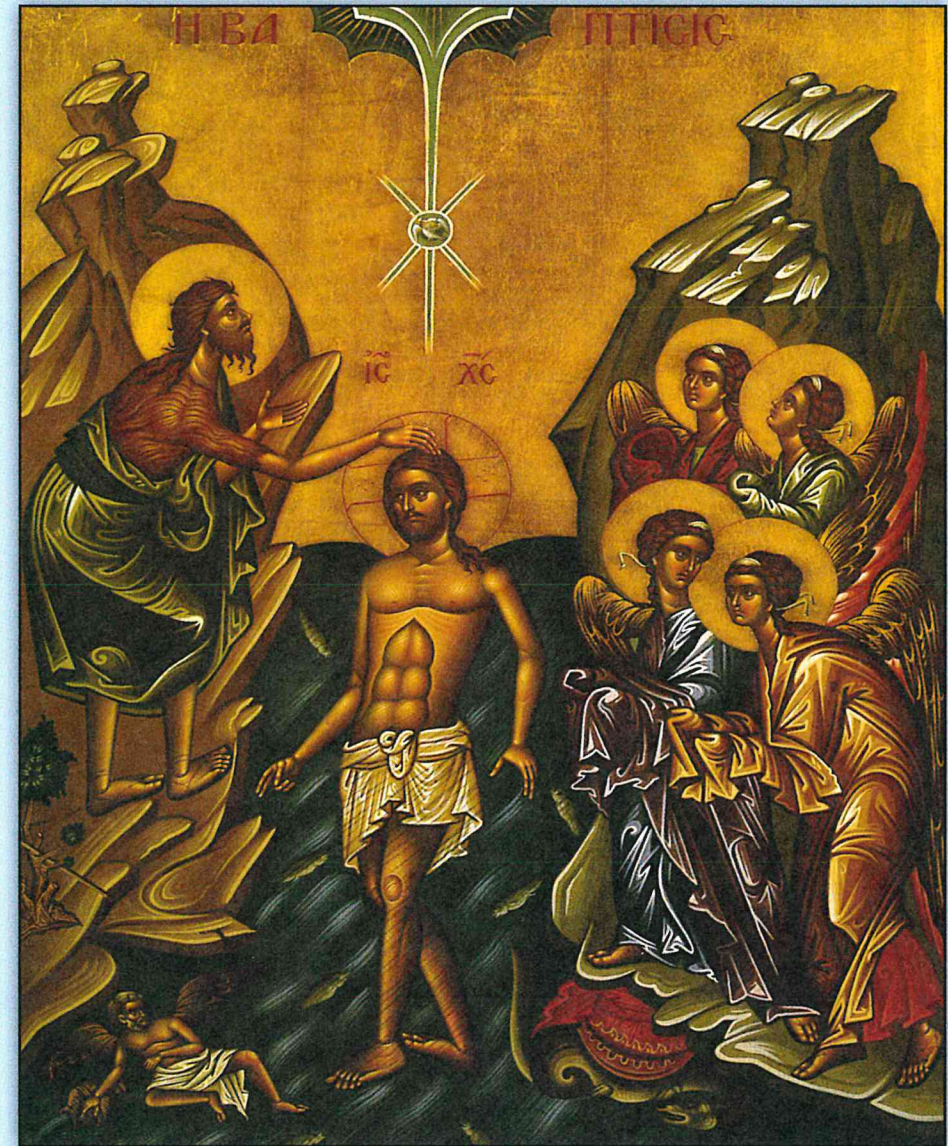
Icon of Theophany -- January 6th