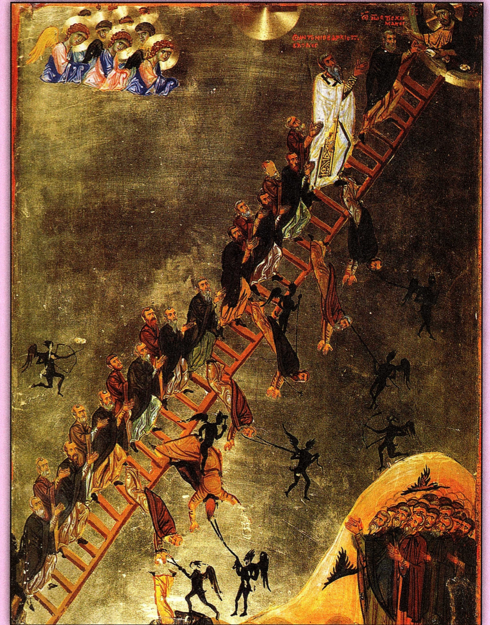
Icon of the Ladder of Divine Ascent