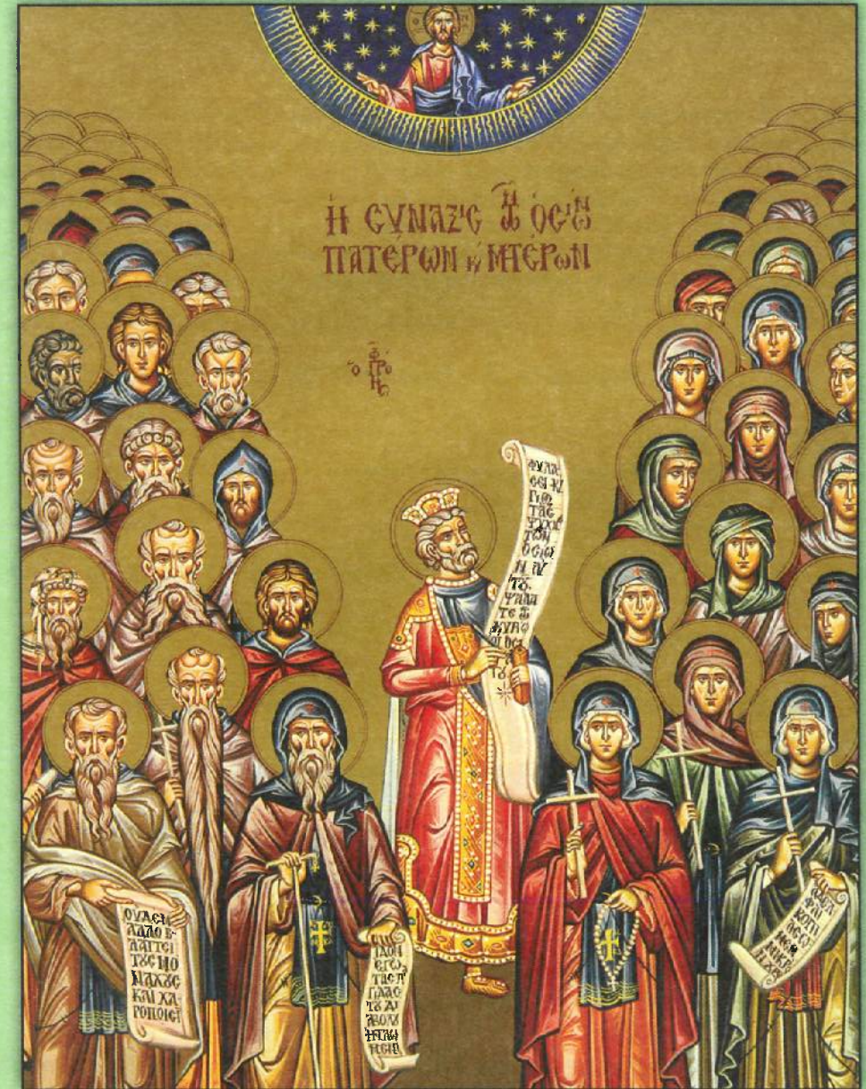
Icon of the Holy Ancestors