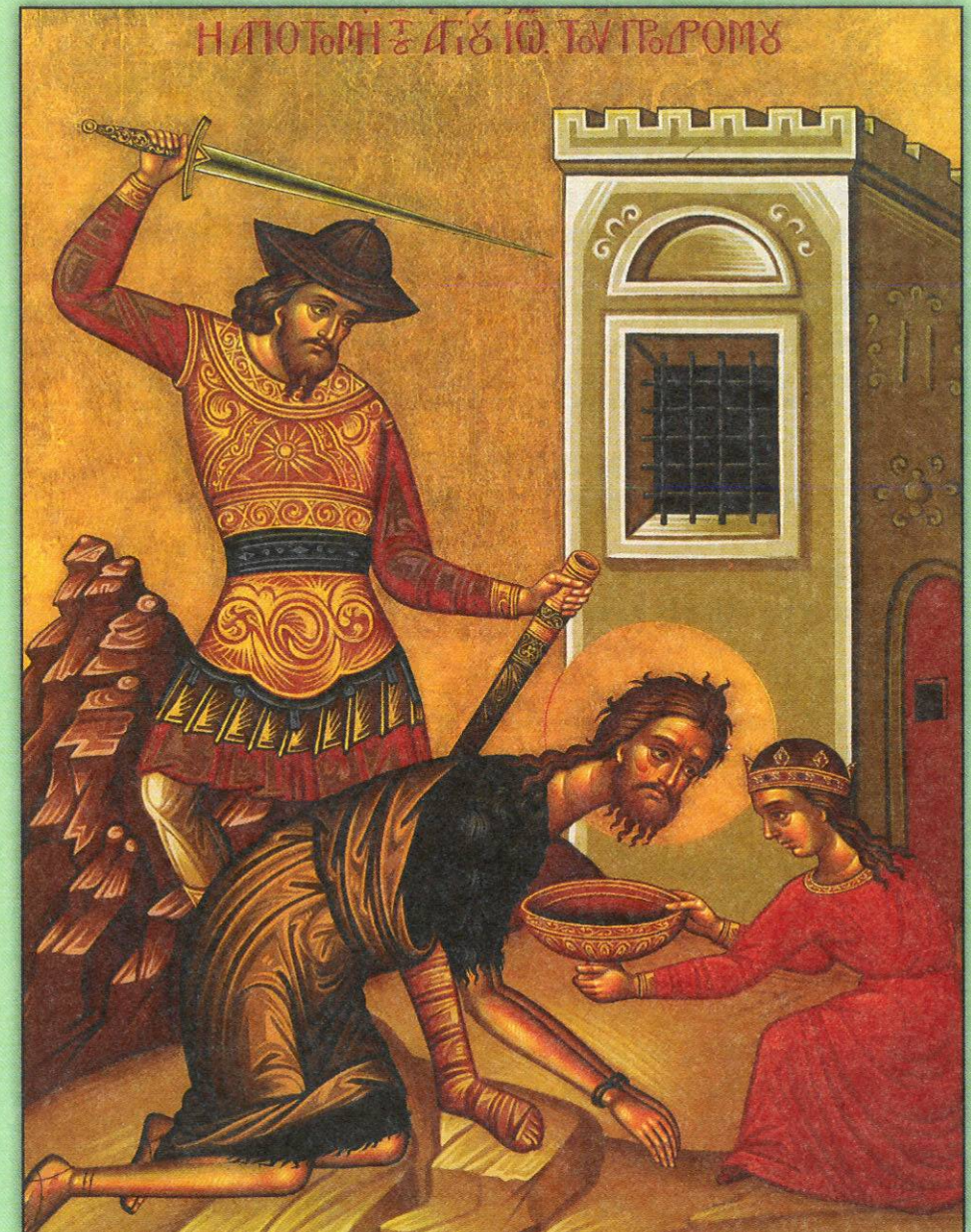
Icon of the Beheading of John the Baptist