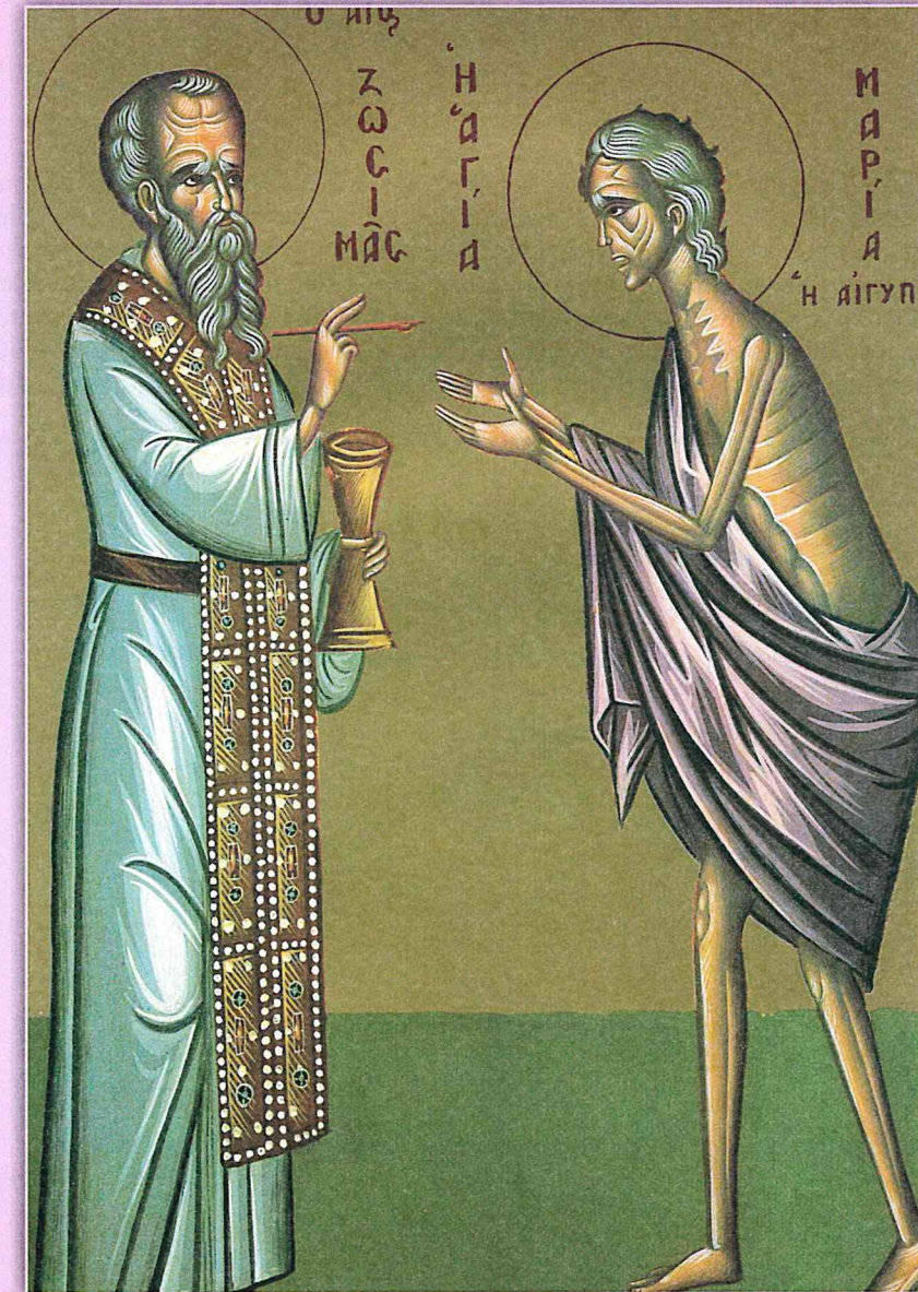
Icon of Saint Mary and Saint Zosimos