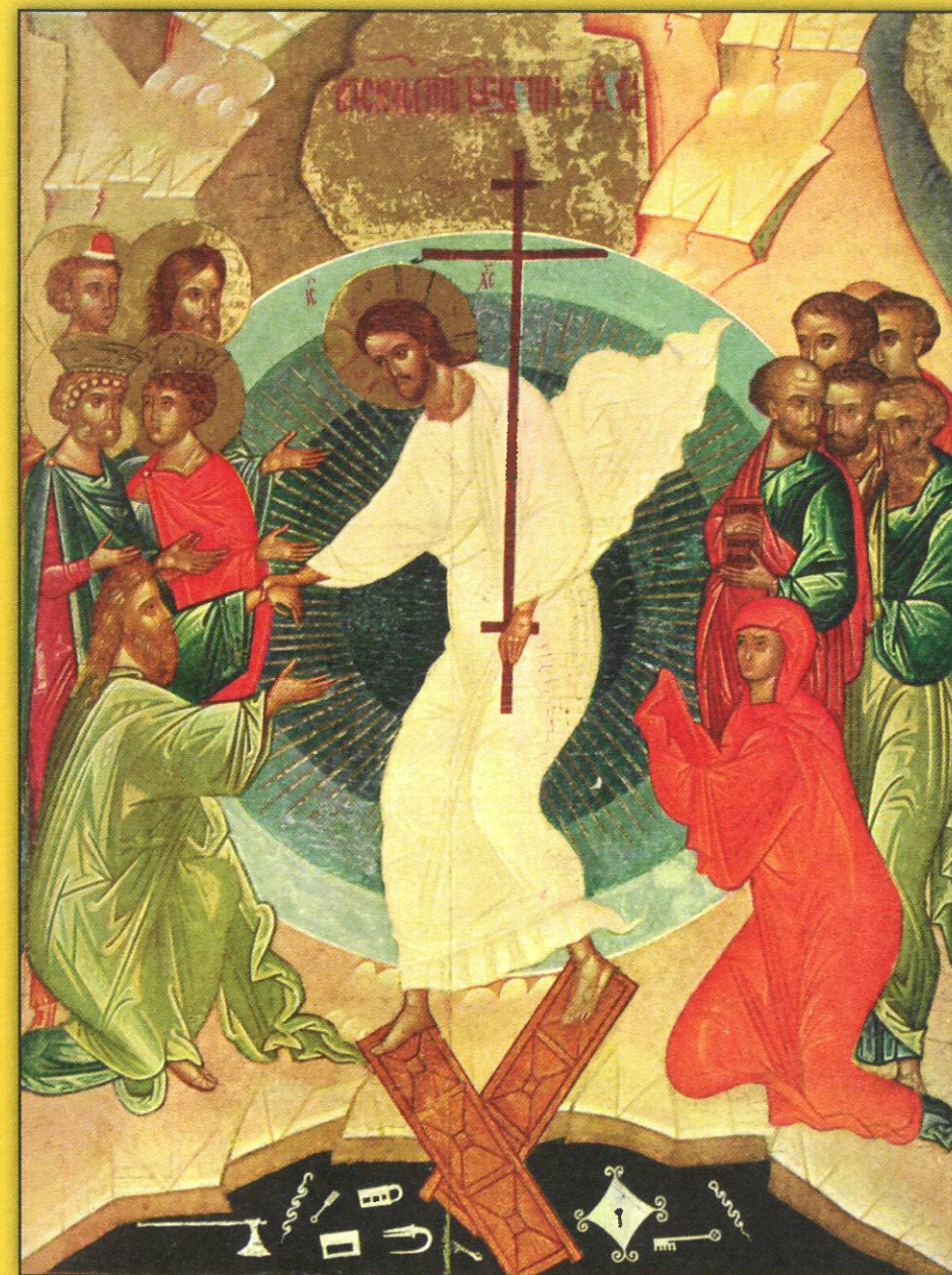
Icon of the Resurrection