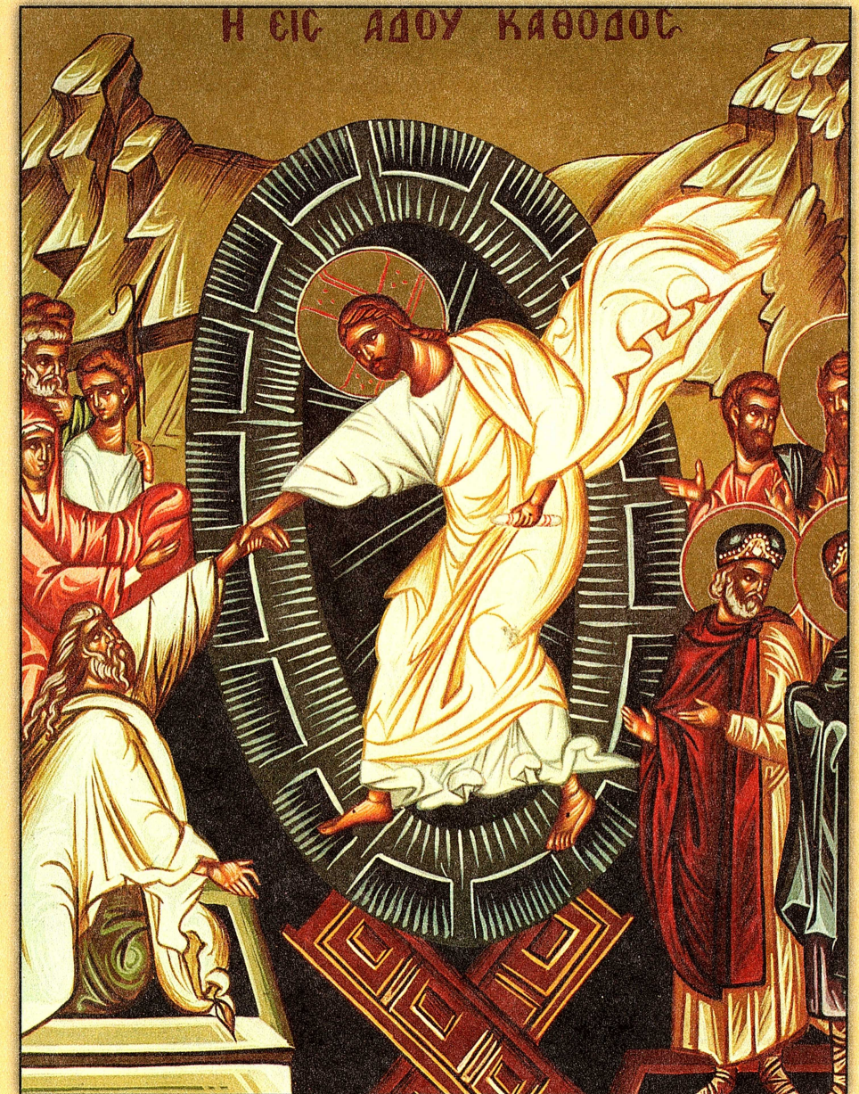
Icon of the Descent into Hades