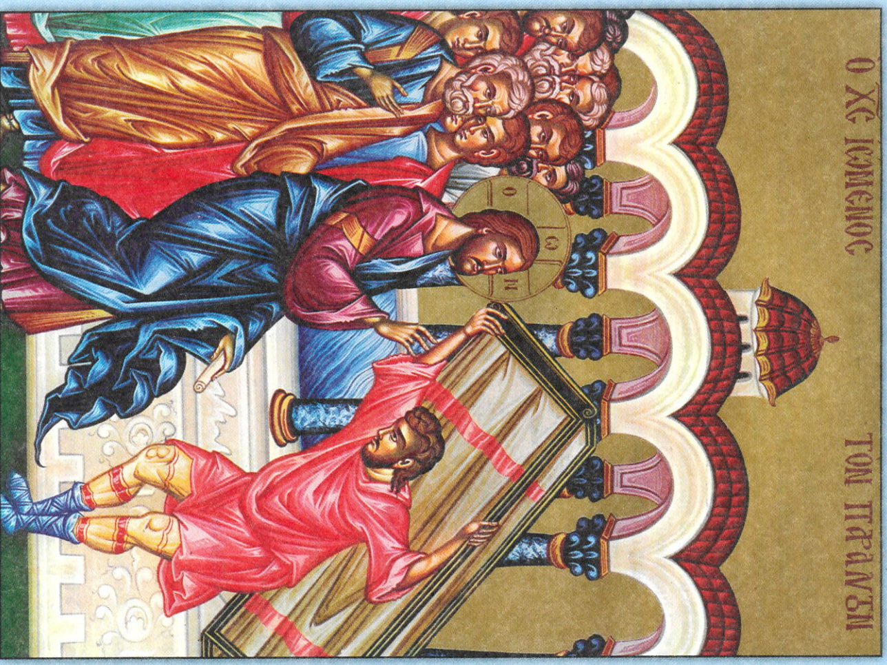
Icon of Jesus Healing the Paralytic Man